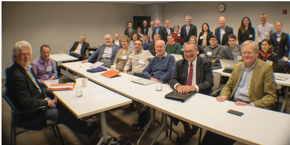
FIGURE 1 Participants of Workgroup 1

How to cite this article: Chapple ILC, Mealey BL, et al. Periodontal health and gingival diseases and conditions on an intact and a reduced periodontium: Consensus report of workgroup 1 of the 2017 World Workshop on the Classification of Periodontal and Peri-Implant Diseases and Conditions. J Periodontol. 2018;89(Suppl 1):S74–S84. https://doi.org/10.1002/JPER.17-0719